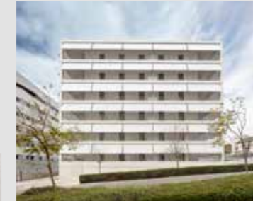
30 SOCIAL HOUSING UNITS DATAAE + Xavier Vendrell studio