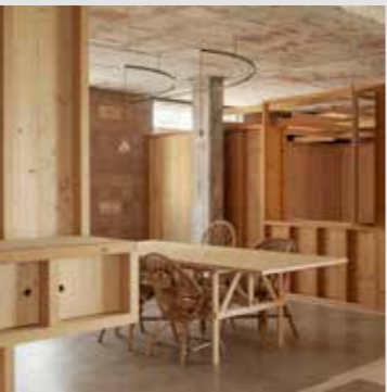
CAN GABRIEL TED'A arquitectes