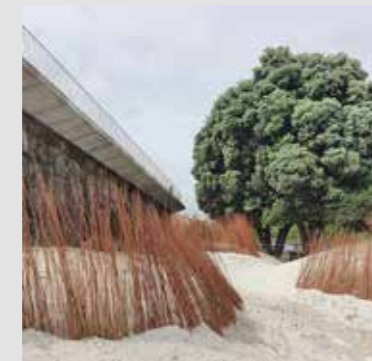
RENATURALIZATION OF THE EDGE OF THE BEACH CREUS&CARRASCO + RVR Arquitectos