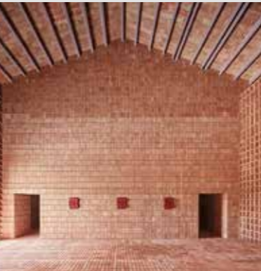
REHABILITATION OF A MULTIPURPOSE AND CULTURAL SPACE Camps Felip Arquitecturia