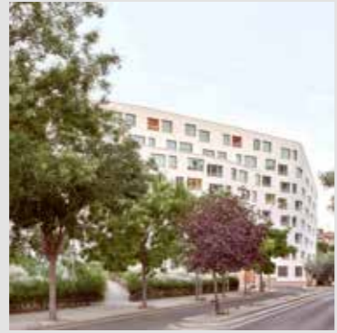
102 SOCIAL HOUSING UNITS IN MADRID MARMOLBRAVO + MADhel