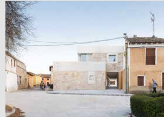
TOWN HALL IN VALVERDE DE CAMPOS Óscar Miguel Ares