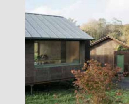
CASA ID Y TALLER GRAU rellam | architecture