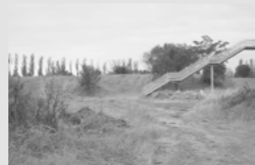
THE STRATEGIC POWER OF THE VOID nUNDO + Catara Rego