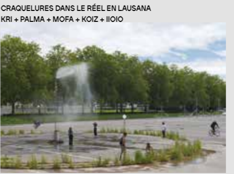
CRAQUELURES DANS LE RÉEL EN LAUSANA KRI + PALMA + MOFA + KOIZ + IIOIO