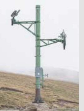
FROM WASTE TO RESOURCE PARABASE + Juan Baraja