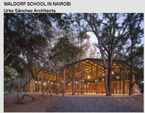
WALDORF SCHOOL IN NAIROBI Urko Sánchez Architects