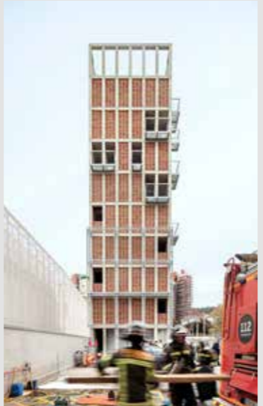
FIREFIGHTERS' TRAINING TOWER IN VALL D'HEBRON Carles Enrich Studio