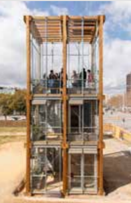
REGENERATING BARCELONA REARQ [UPC] + GICITED [UPC] + Constraula - Sorigué