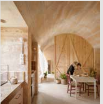
RESOURCE MAP / EVPP IN SANTA EUGÈNIA Carles Oliver + Xim Moyà