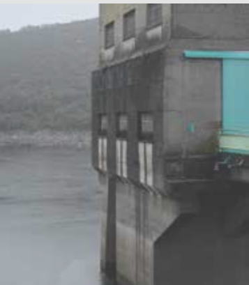
WILD WATERFALLS, FLOWERS AND CROWS Elisa Gallego + Catara Rego