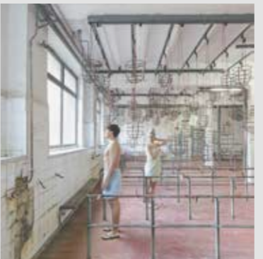
COAL: FROM EXTRACTION TO ATTRACTION longo + roldan + Ana Amado