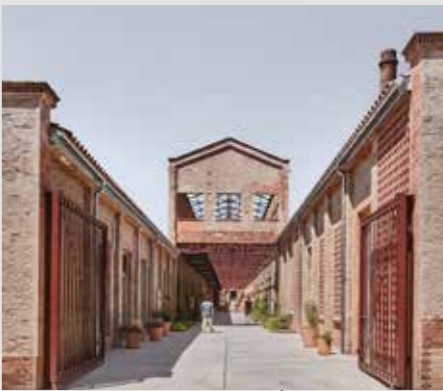
REHABILITATION OF THE VAPOR CORTÉS. PRODIS 1923 H ARQUITECTES