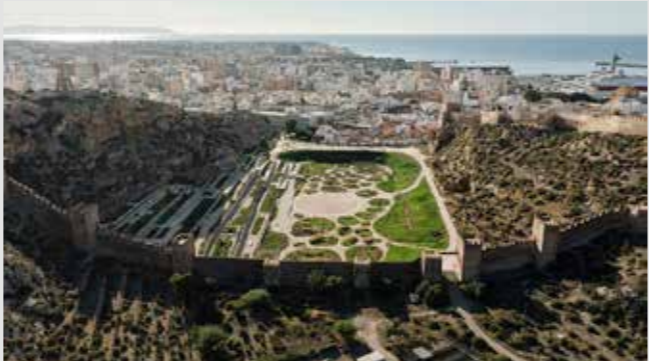
MEDITERRANEAN GARDENS IN LA HOYA Kauh Arquitectos