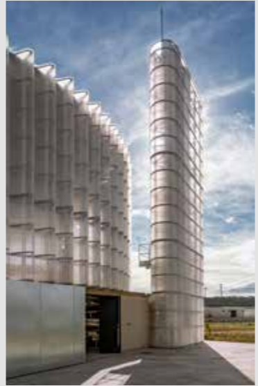
ECOLOGICAL THERMAL POWER PLANT FRPO Rodríguez & Oriol estudio