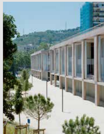
VALL D'HEBRON RESEARCH CENTRE BAAS arquitectura + Espinet/Ubach arquitecte