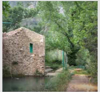
THE ROAD TO THE OIL MILL Carpe Estudio + PlanoPlano Estudio + Miguel Hernández