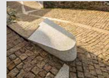
REHABILITATION OF PUBLIC SPACE IN NEBRA Carlos Seoane