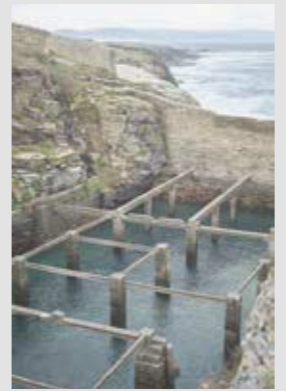
THE CONSTRUCTION OF THE SEA-FRONT AS A SUPPORT David García-Louzao + Catara Rego